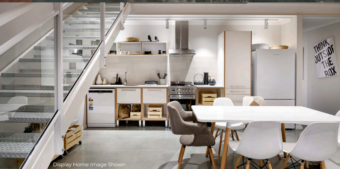
Display Home Image Shown