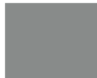
Windspray® (SA 0.58)

Please check the Suppliers' websites for the SA rating at the time of specifying the roofing colour.